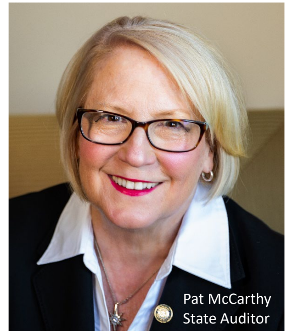
Pat McCarthy State Auditor

2,448 audits conducted (January 1, 2022– December 31, 2022)